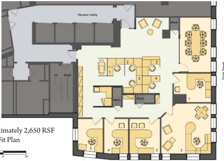
3rd Floor - Approximately 2,650 RSF *Test Fit Plan